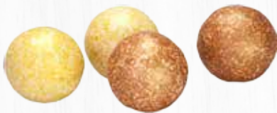
XMAS Balls Deluxe