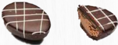
Egg white stripes