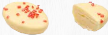
Egg Red Crystals