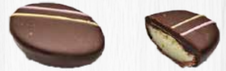
Egg yellow/pink stripe