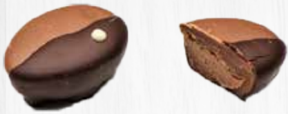
Egg Half Dark-Milk