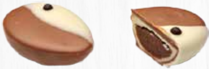
Egg Half White-Milk