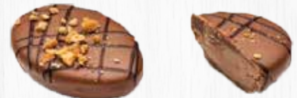
Egg with nuts