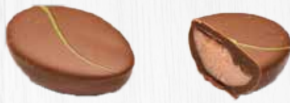
Egg Green Stripe