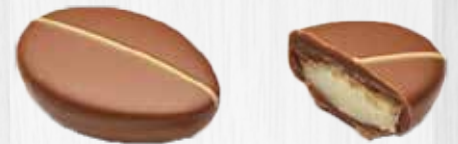
Egg yellow stripe